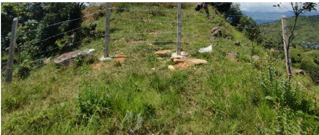
Plantation site in Dhading district were protected by barbed wire fencing

Dhading site: This location was chosen so that there was no need to fence in the entire perimeter. The possible entry point was a barbed wire fenced with concrete pillars.