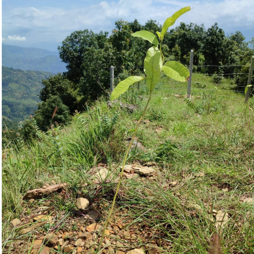
Seedling of the tree growing inside the fencing

Weeding: During the patrolling and as a dedicated activity, the local stakeholders will perform weeding around the planted seedlings.