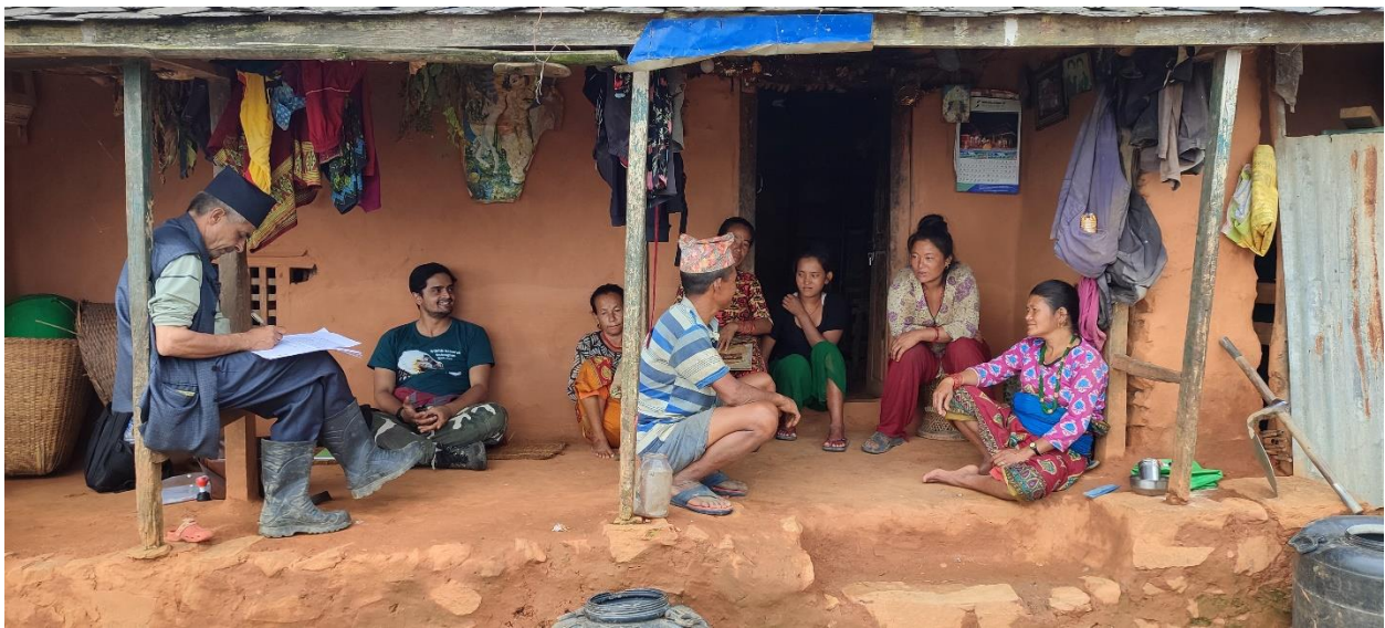
Signing of contract with leader of a local community in Dhading District

A sub-contract was established based on responsibilities of both the parties, and signed between FON Nepal and the local authorities of the tree plantation project.