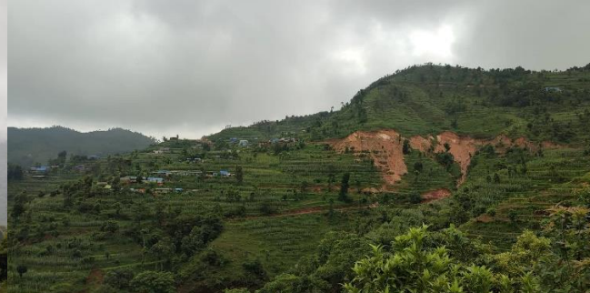
Plantation site (Chisapani) at Dhading district