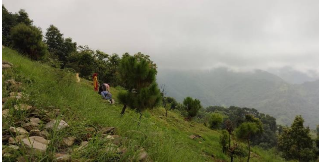
Plantation site (Kalika) at Kanhu of Kaski District

Respecting the customary rights, and recognizing the traditional practices, the abandoned and degraded lands in and around the village were selected for the tree-planting program.