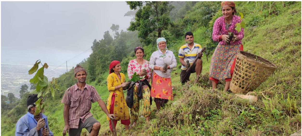
Local people during plantation-Kaski