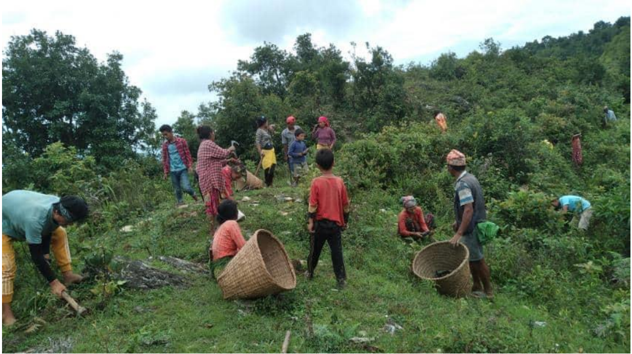
Local people during the cleaning of afforestation site-Dhading