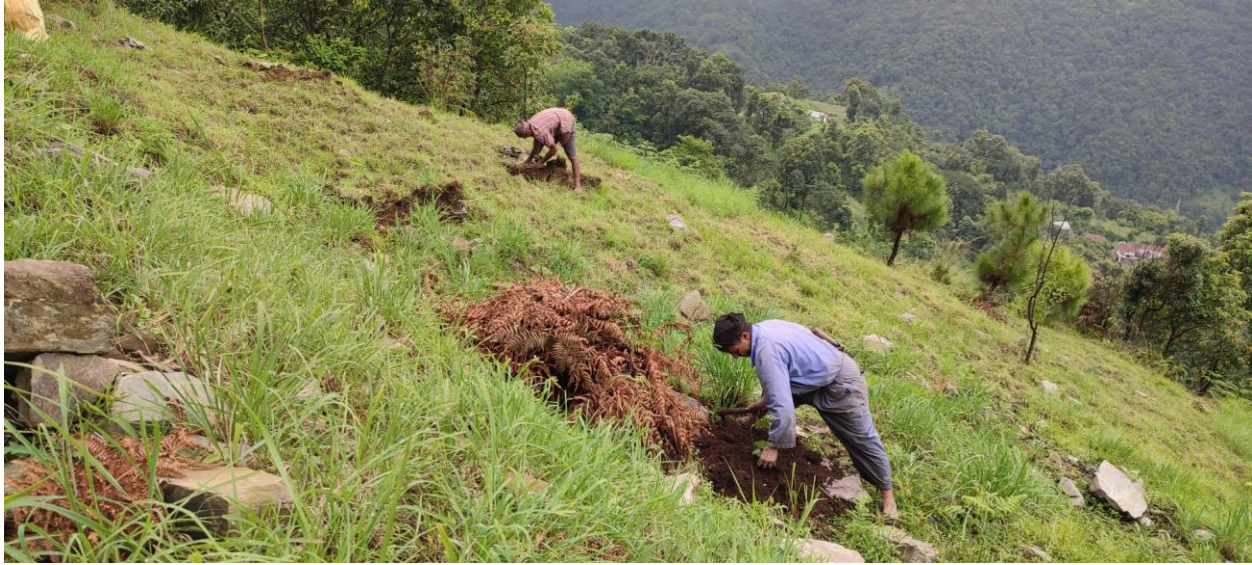
Digging for plantation